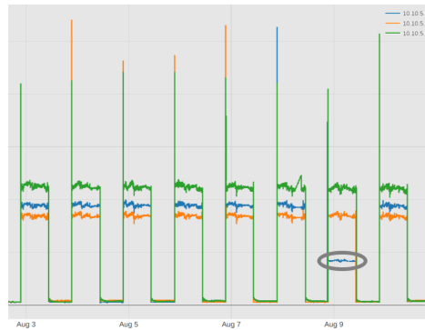
Fig. 2: Current over time of 3 streetlights.